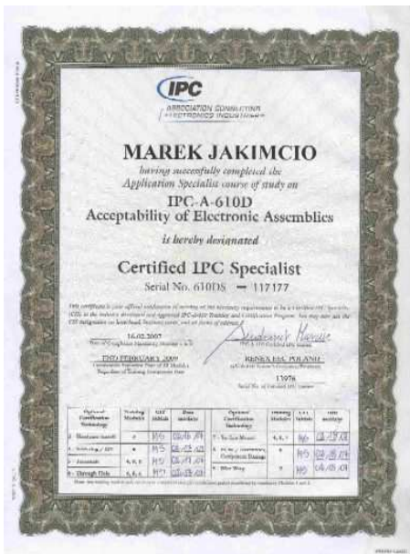
Some of our employees are certified IPC specialists...