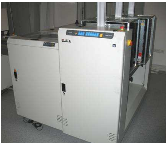
Transportation system - Nutek