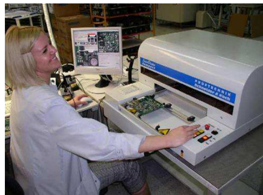
Automatic Optical Inspection Offline Unit