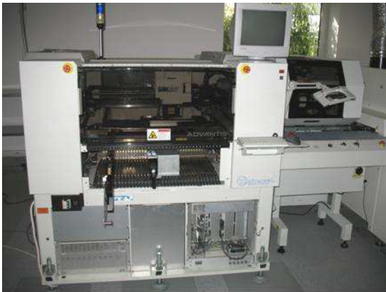
pick&place machine: Universal Advantis AC-72 (14000 cph) platform tray feeder Universal