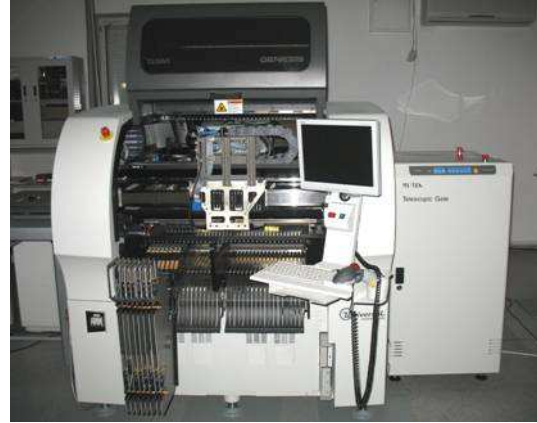
pick&place double head machine: Universal Genesis GC-60 (57000 cph)