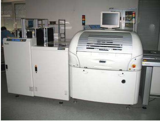
automatic screen printer DEK 265 Horizon 02