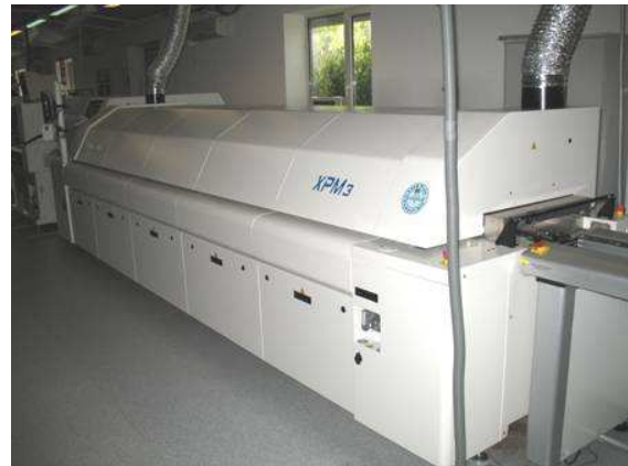
reflow oven: Vitronics Soltec XPM3-1030