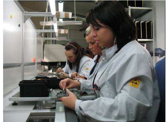
One of our manual insertion lines...